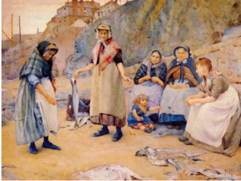
Newlyn School of Artists: Sharing Fish: Thomas Cooper Gotch

The Shawls are depicted with check / tartan designs