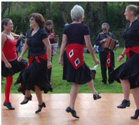
Tros Ha Treys