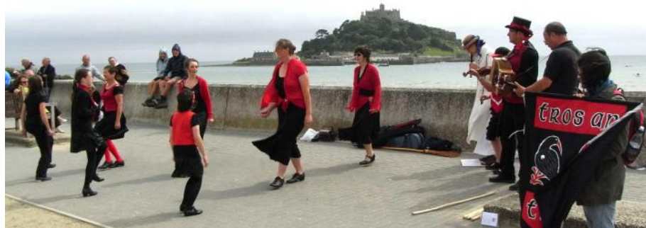
Publicity photos 2009