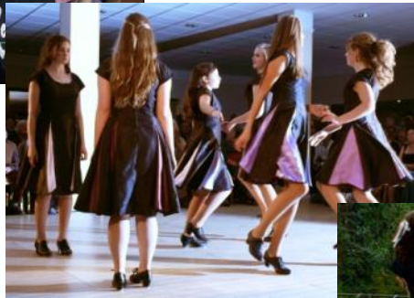
Publicity Photos 2009