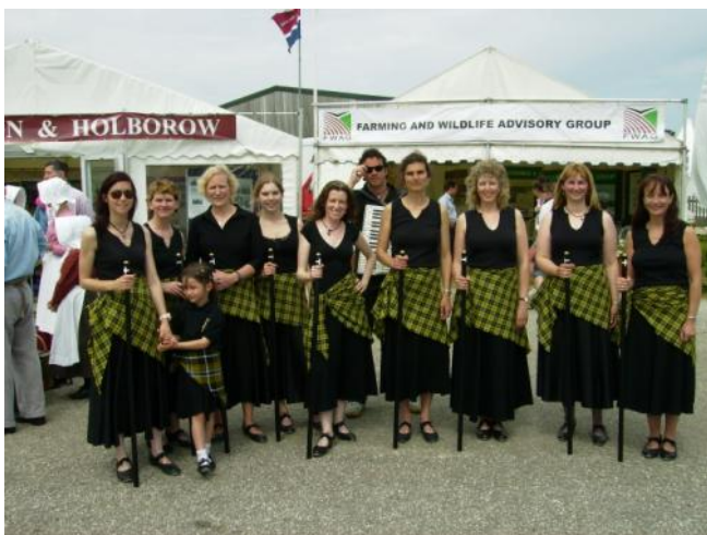
Asteveryn wearing Cornish National Tartan Shawls